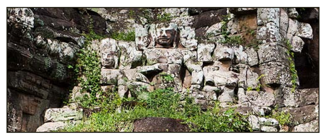
At the south gate entrance of Angkor Thom, the royal trio greets all visitors.

Recent research on what appear to be royal portraits of the two queens reveal evidence of female power and participation within the government. Additional evidence from illustrated bas-reliefs, monument pediments and written inscriptions on steles offers insights that document the proactive approach these women took as unsung pioneers of social values and women's rights.