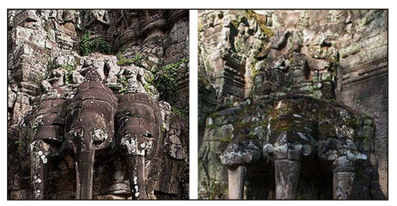
Elephants wearing conic crowns remain below the defaced royal trio.

At ground level on both sides of each gate appear the special three-headed elephants of Indra, the Hindu God of Gods. Here, the king fitted the symbolic elephants with three conic crowns of lotus petals. This subtle but powerful change implied to all that these were no longer Indra's elephants, but Jayavarman VII's royal elephants. The king was proudly accompanied by his two queens smiling always, one on each side of him. All three royal benefactors sat astride the elephants welcoming every visitor (see below).