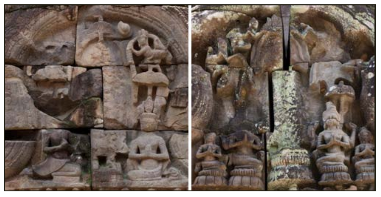
On the left was a restored pediment showed traces of a standing Prajnaparamita, who the defaced royals worshiped. On the right, a pediment is now missing Prajnaparamita.