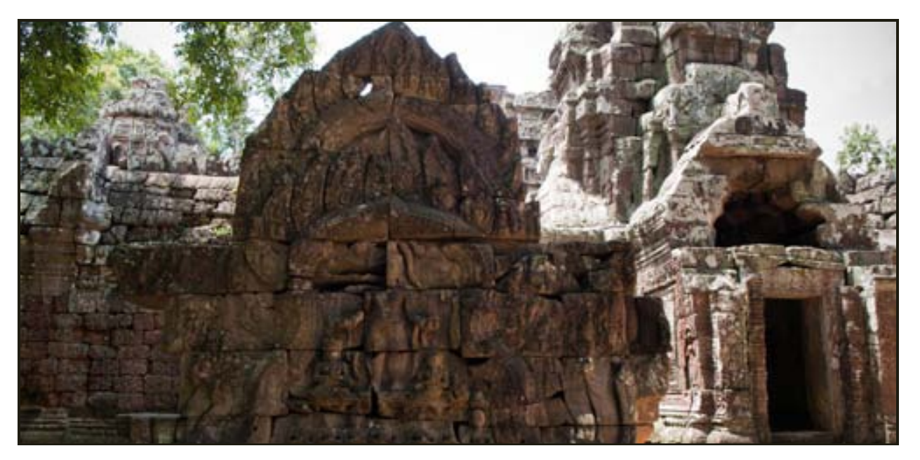
French conservators reconstructed a fallen pediment at the temple's entrance. The king, on the left, worshiped Avalokiteshvara.