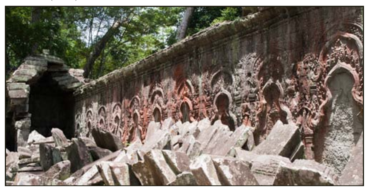
Each alcove originally held the Mahayana trinity in relief, but religious conflict caused them to be removed later.

The royal trinity's brand of Mahayana Buddhism was infused with respect for women through the goddess Prajnaparamita , the Mother of all Buddhas. The trinity included the Lord Buddha; Lord Avalokiteshvara , the compassion of all Buddhas; and the goddess Prajnaparamita, the perfection of transcendent wisdom. During their reign, the empowerment of this trimurti or trinity, was represented in bronze statues (above) and extensively carved on the royal trio's monuments (below).