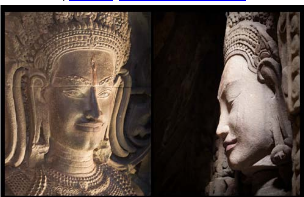
By Phalika Ngin - This article appears online at Devata.org

In 12th century Southeast Asia the Khmer civilization brought education, health, spirituality and enlightenment to the masses. Two women, King Jayavarman VII's queens, played critical roles in the kingdom's expansion and success.