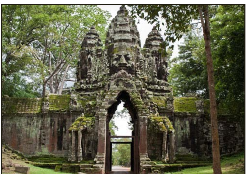
North gate of Angkor Thom, note the paired 3-headed elephants and missing pediments with the facades, thus exposing the roofing's frame into the king's giant faces.

All visitors to the great walled city of Angkor Thom still receive additional confirmation of this ideology. For more than 800 years, every visitor has had to enter and exit through one of five gateways into the Angkorian city-fortress that the royal trio built. At each gate, they created clear and subtle messages of their spiritual and personal beliefs.