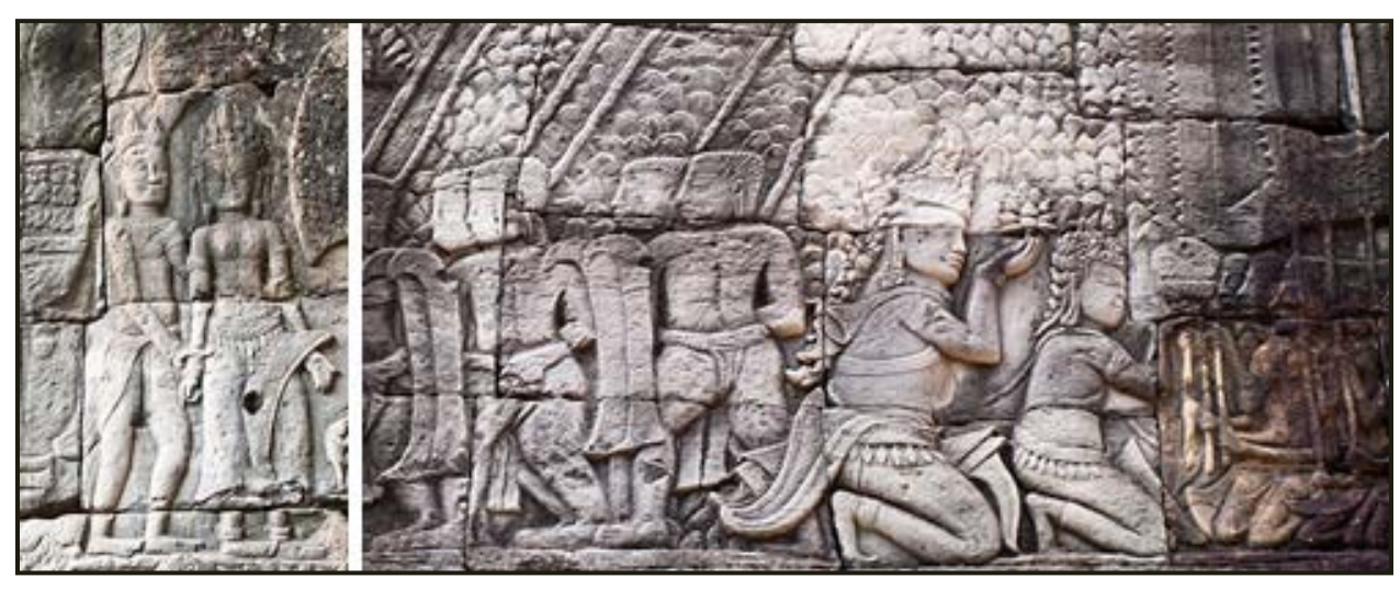
The queens lead the way in these illustrations.

In a bas-relief depicting their romantic and personal lives, the king followed the lead of Queen Jayarajadevi. On exterior reliefs at the Bayon, the two queens followed the king's processions. In one particular bas-relief, one queen sits before the king, with both figures praying for the safety of their soldiers and victory in an upcoming battle (see photo below).