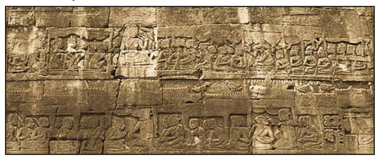
Education in Bayon bas-relief. In the top register, the two queens lecture before crowds of girls and boys. The lower register depicts military arts training. Men are briefed in the classrooms.

To perpetuate these social systems, the inscriptions encouraged future kings and aristocrats to follow their charitable example of supporting public works by promising merit and heavenly rewards.