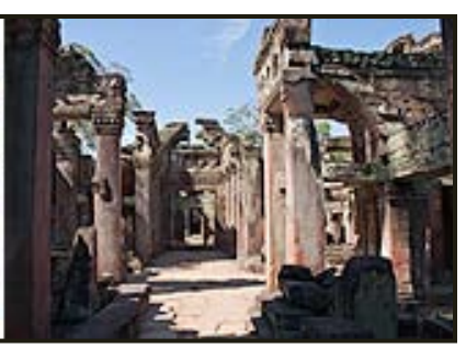
Angkor Thom, Bayon and Preah Khan.

Together, this royal trio made some of the most important contributions to Khmer heritage: