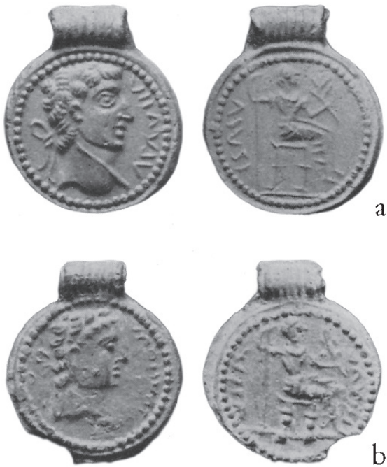
Fig. 15. Clay pendants from Kondapur, Andhra Pradesh (southern India). Scale approx. 1:1 (from Wheeler 1954: Plates 28 and 29).

state Andhra Pradesh in south-eastern India. Some of them are rather faithful copies with a legible legend, the majority are more distant imitations, some still with a pseudo-legend, others without any legend at all. The better imitations were made of metal, sometimes lead covered with gold foil, the others are usually made of clay (fig. 15) and are clearly of local Indian manufacture, which is also assumed for the metal imitations. Usually, these Indian imitations, even those made of clay, have the double piercing commonly encountered on Indian coin pendants, but many of the clay pendants were moulded together with their suspension loops of a ribbed tubular shape like that of the Khlong Thom pendant 43 . The pendant from Khlong Thom is certainly to be seen in the context of the popularity of the Indian pendants imitating this particular coin of Tiberius. Such pendants might have