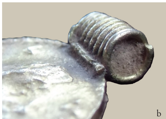
Fig. 10. Details of the suspension loop of the gold pendant from Khlong Thom shown in Fig. 9.

from Khlong Thom (cat. no. 7, fig. 11). In diameter, the cast gold disc corresponds to a Roman aureus , but, as visible in the break, it is rather thin, and its weight less than 3 g. Presumably, it was also intended as a pendant; the top part of the disc is missing, and might have been broken off, together with the suspension loop.