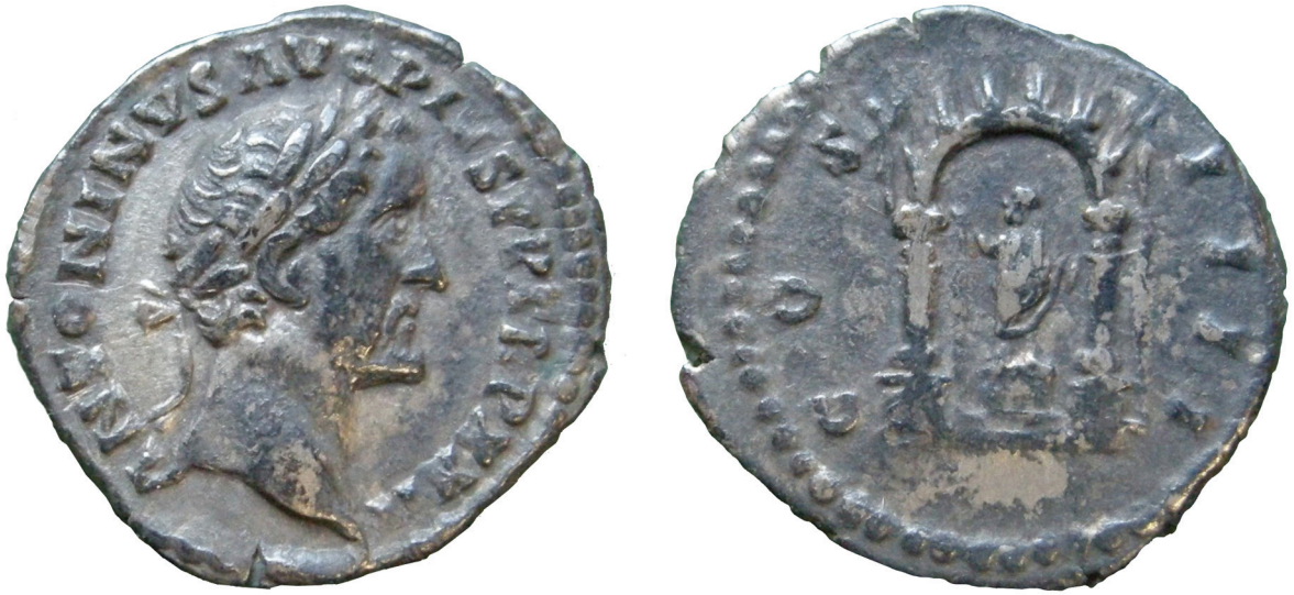
Fig. 8. Glasgow, The Hunterian Museum and Art Gallery no. 112. Denarius of Antoninus Pius, 158–159 C.E.

the coins of Antoninus Pius for a possible prototype. The major part of the legend can be clearly read. It begins on the left with ANTONINVS, and, leaving an empty space above the head, continues on the right with IVS PP followed by a group of unclear letters. Although the break in the legend above the emperor's head is a feature frequently found on Antoninus Pius' coins, here, most strikingly, an essential part of the regular legend is missing; the letters AVG for the title Augustus and the P of Pius. This could be explained if the prototype had a continuous legend with these four letters placed above the head, where, on the imitation from Khlong Thom, the blank space appears. Such a layout is found on silver coins of Antoninus Pius issued in the years 158–160 C.E. 23 They have a continuous legend, ANTONINVS AVG PIVS P P TR P XXII, respectively TR P XXIII, from left to right, so that the AVG and the P of PIVS appear just above the head, as seen here on a coin of the year 158–159 C.E. in the Hunter Coin Cabinet in Glasgow (fig. 8). In a closely similar manner, the legend on the Khlong Thom piece begins with the A of Antoninus on the left at the back of the neck, the S of Antoninus