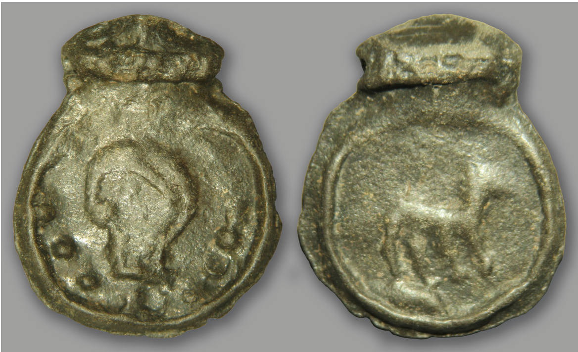
Fig. 13. Cat. no. 9. From Khlong Thom (southern Thailand). Suthiratana Foundation, no number.

Septimius Severus with a date-range limited to the years 198–202 C.E. might have been issued. It is here of special numismatic interest that, by way of this imitation, indirectly an otherwise unknown reverse of Septimius Severus has been regained. In a jewellery ornament, which we assume the Thaksin imitation to be, the hybrid combination of obverse and reverse copied from coins of different emperors would be no matter of any consequence.