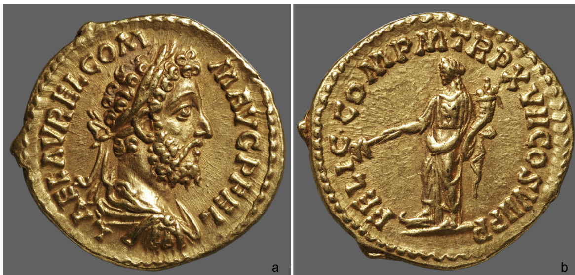
Fig. 5. Vienna, Kunsthistorisches Museum inv. 35.207. Aureus of Commodus, 192 C.E.