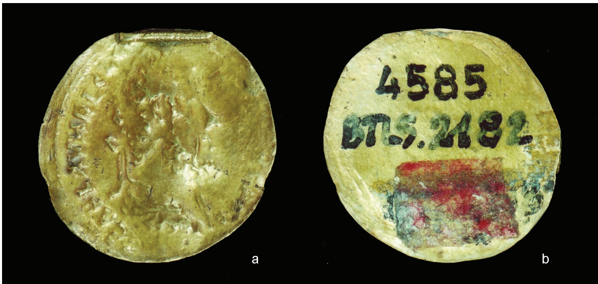
Fig. 4. Cat. no. 2. From Óc Eo (southern Vietnam). Museum of Vietnamese History, Ho Chi Minh City, inv. 2182.

account for the plain reverse 16 . However, as already Malleret assumed, it seems more likely that it was cast, as this would better explain the soft and soapy character of the modelling, in particular at the transition between ground and raised relief.