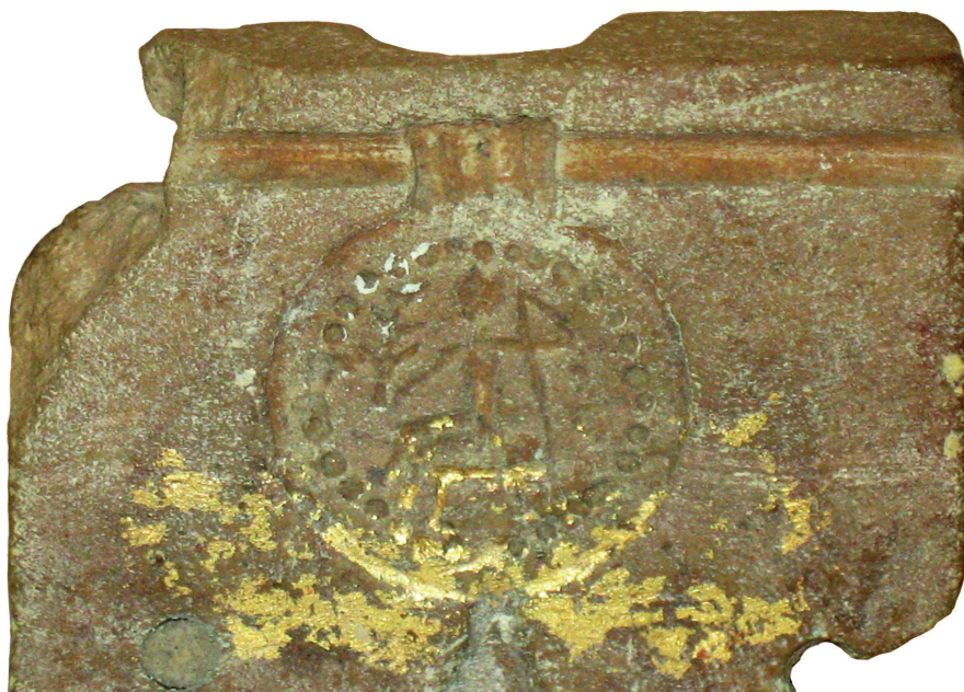
Fig. 16. Cat. no. 10. Stone mould from Khlong Thom (southern Thailand), Wat Khlong Thom Museum.

discerned, which are said to resemble the letters MAXIM of the original coin legend 44 . Judging from the drawings, the motif on the Banavasi mould seems to be rendered in a rather stylised manner, similar to the angular stylisation on the Khlong Thom mould. Comparable are also double pierced clay imitations of the PONTIF MAXIM coins from Bhokardan (Maharashtra) 45 . Like the pendant described above (fig. 14) the stone mould from Khlong Thom is to be seen in the context of the widespread Indian production of such coin imitation pendants. The importance of this find lies in the fact that it is evidence for the local manufacture of such pendants at Khlong Thom.