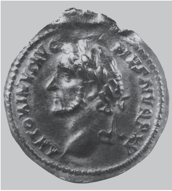
Fig. 1. Cat. no. 1. From Óc Eo (southern Vietnam).

from the coin, and then casting the bronze die in the lost-wax process. At the top, the gold sheet forms an extension which is partly broken off, but probably served to suspend it for use as a pendant.