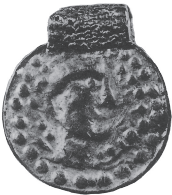
Fig. 3. Cat. no. 3. From Óc Eo (south- ern Vietnam).

Such use as a pendant finds further confirmation in another disc of thicker gold sheet from Óc Eo which is preserved complete with its attached suspension loop (cat. no. 3, fig. 3) 15 . It has a slightly larger diameter, and has a repoussé decoration vaguely reminiscent of the obverse design of a Roman coin. A coarsely-rendered head to the right is surrounded by a circle of embossed dots recalling the beaded circle of a Roman coin. More dots appear in the field behind the head and in front of it – perhaps meant as substitutes for the letters of a coin legend.