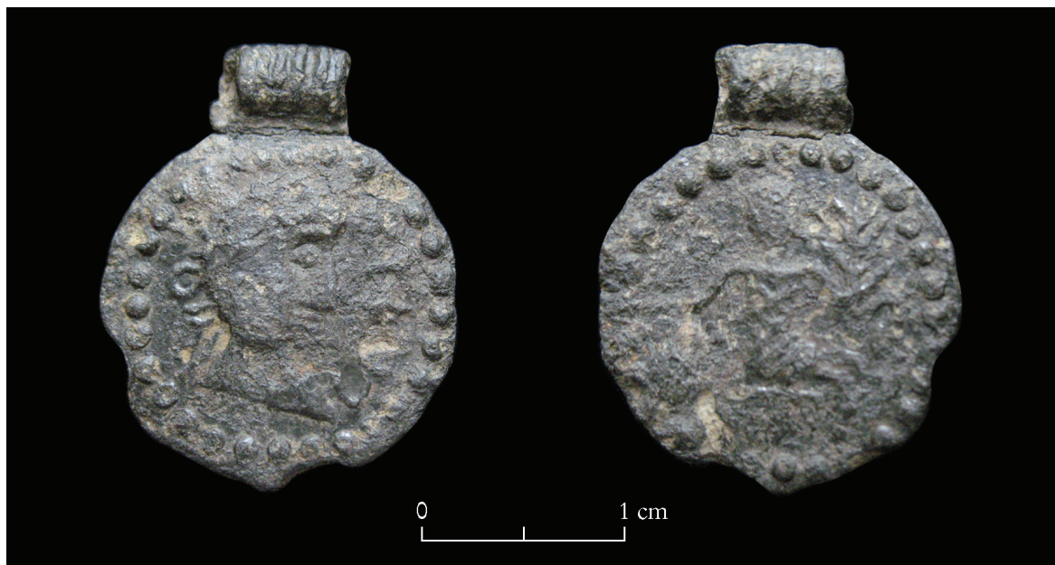
Fig. 14. Cat. no. 8. From Khlong Thom (southern Thailand). Suthiratana Foundation, no number.

refuse of tin working found at the site. One side of the pendant shows a head in profile to the left, crudely sketched in raised outline surrounded by a rudimentary beaded circle, a distant recollection of a coin design. The back depicts an indistinct quadruped to the right on a short groundline.