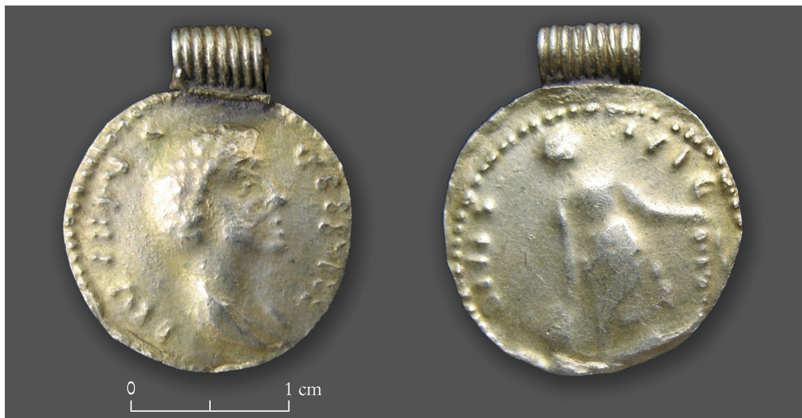
Fig. 9. Cat. no. 7. From Khlong Thom (southern Thailand). Suthiratana Foundation, no number.