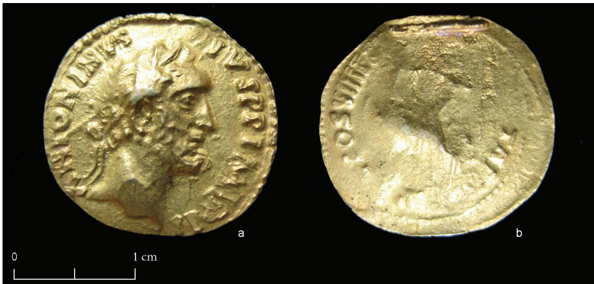
Fig. 7. Cat. no. 5. From Khlong Thom (southern Thailand). Suthiratana Foundation, inv. KLP 071.

the gold disc from Óc Eo (Fig. 6a) 21 . Likewise, on these coins of the year 192 C.E., details of the bearded head of Commodus with laurel wreath to the right, the bust cuirassed and draped, appear closely comparable to the Óc Eo piece. Such details are, for instance, the two ends of the ribbon behind the neck parting in two directions, the sharp ridges of the paludamentum folds around the neck, and its drapery folds on the chest forming an acute V-shaped angle. Even the general layout and, in particular, the space between the back of the head and the legend seem to correspond (figs. 4a, 5a, 6a,b).