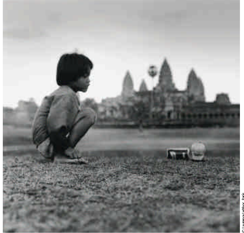
Angkor Wat: realm of divinities and city of mortals.

Between the 9th and the 14th centuries, Angkor, the capital of the kingdom of Cambodia, grew up between the Kulen hills and Tonle Sap, the Great Lake. At the height of its power, the kingdom included parts of present-day Thailand, Laos and Viet Nam. Over the centuries, kings who practiced religions that came from India, Hinduism and Buddhism, erected monumental stone temples where they honoured their gods. They also built an elaborate hydraulic system comprising