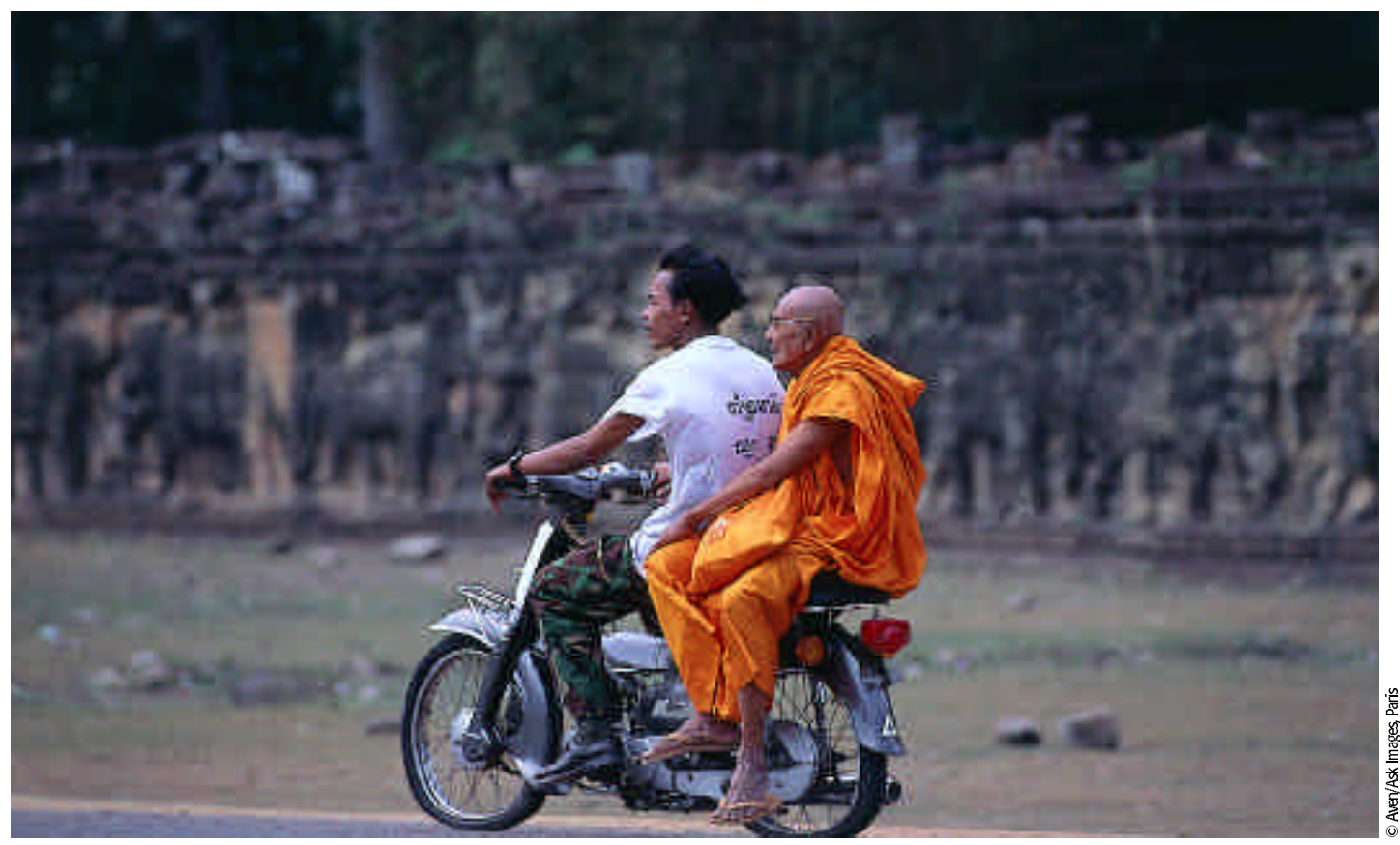
Modern times: Angkor's challenge is to strike a balance between preserving its heritage and coping with expanding tourism.

on the temple restoration projects. Technical jobs such as motorcycle, radio and television repair and battery-charging are also emerging.