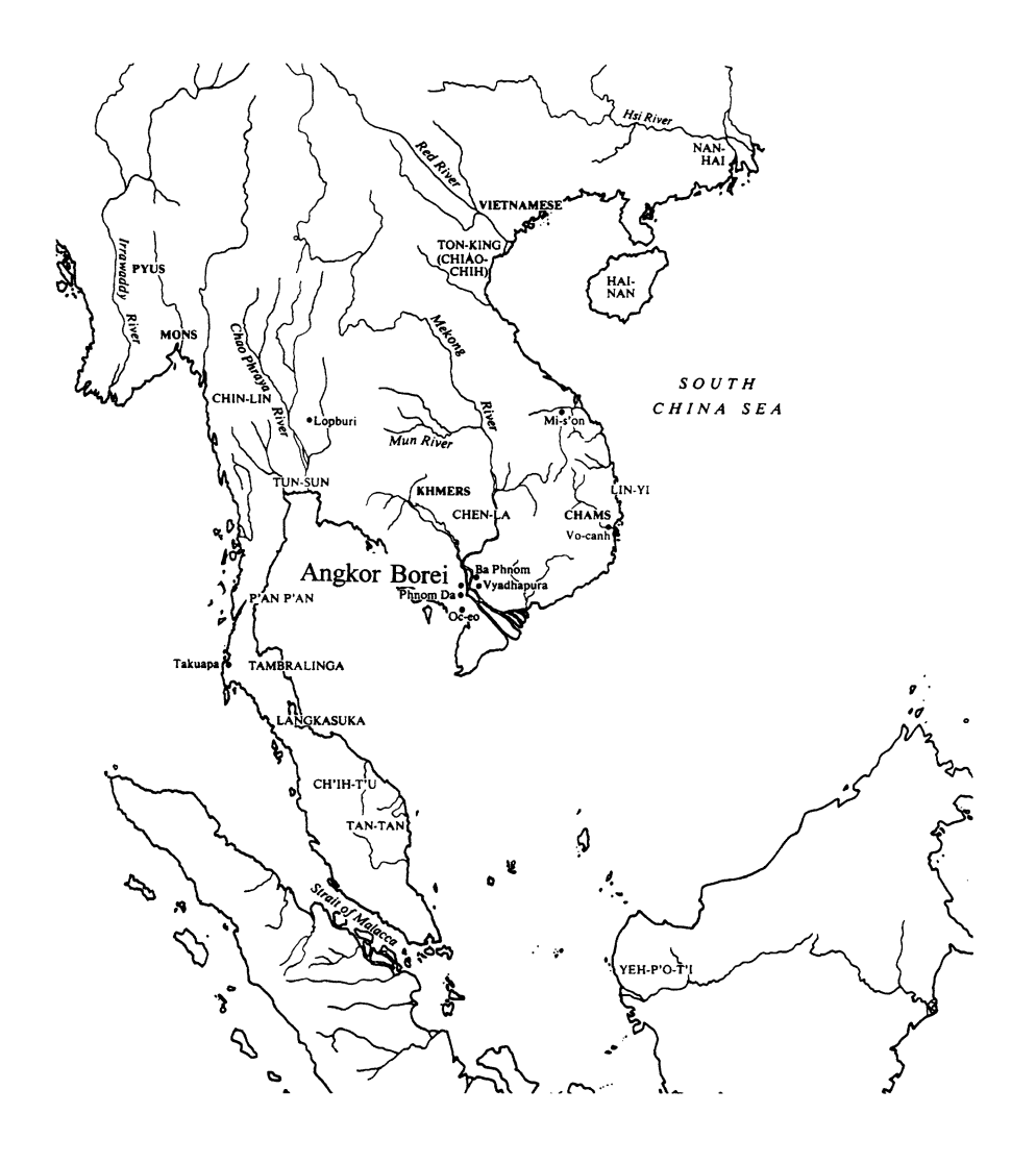
Figure 1 Mainland Southeast Asia in the first millennium A.D. Adapted from Hall (1985, map 1, p. 22) with permission from Univ. Hawaii Press.

incorporate internal factors as well (Reynolds 1995, Wolters 1999). The lack of systematic archaeological research on post—A.D. 500 settlement patterns (Miksic 1995, p. 56) has hindered progress. Until recently, political unrest and its accompanying hazards (such as land mines) have favored the use of remote sensing rather than pedestrian field survey and test excavations (but see Welch 1989, 1997). This chapter reconstructs mainland Southeast Asia's first millennium A.D. history by triangulating between archaeological, art historical, epigraphic, and paleoenvironmental data sources.