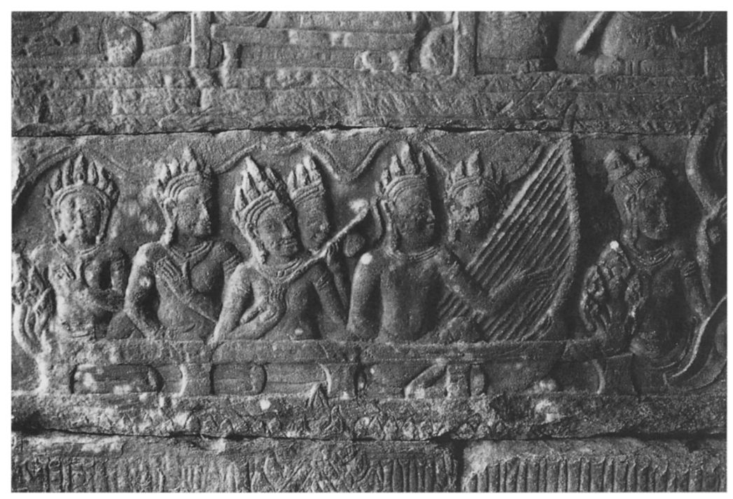
Fig. 3 - Bayon (12th-13th century). Court-orchestra with a vīnā-player.

Tarlekar listed an ancient Indian instrument of a lute-type having two or three gourds named kinnarī vīṇa (1972: 34). I am therefore inclined to see a 'lute' in O.Khm. kinnara. Besides, although the word has not survived Angkor, the lute has, till the present day but under a new name, khsae tīev or sāṭīev /sədiew/, made of one hollowed half-gourd which is held by the musician pressed on his chest.