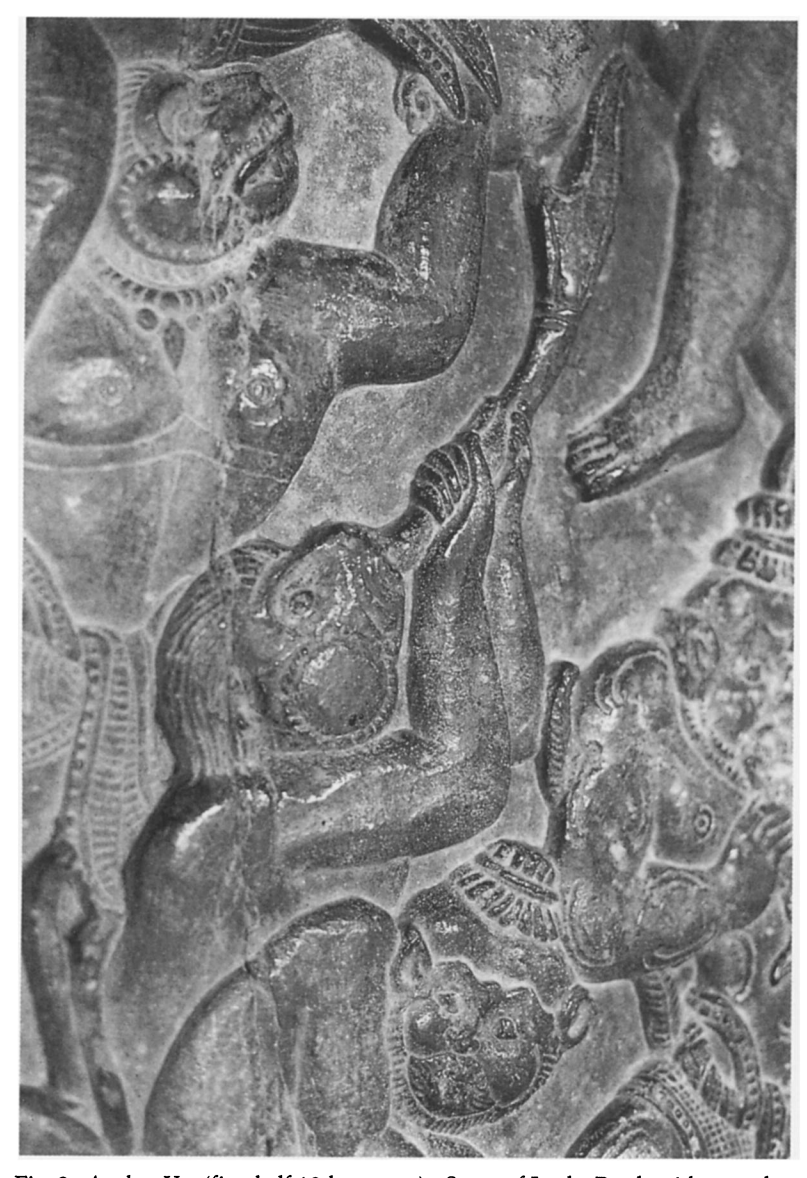
Fig. 2 - Angkor Vat (first half 12th century). Scene of Lańk \bar{a} Battle with a monkey blowing a kind of trumpet.