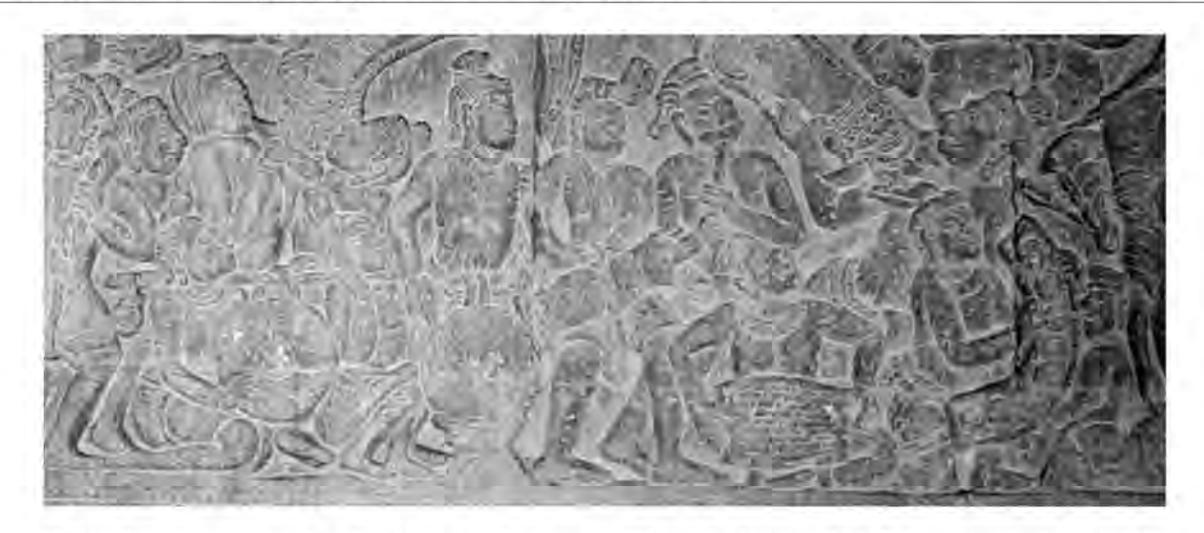
9. North gallery, east wing. The battle of Shonitapura. The relief is more than 300 years younger than the other bas-reliefs of Angkor Wat. It includes representations of a chime of bulbous gongs [khong vong?] which are shown only on younger reliefs, and a big horizontal drum [sampho?] on the right-hand side. Instruments like these are in use in the modern Cambodian pin peat ensemble. The mouthpiece of the wind instrument in the middle [sralai?] is different from the those on the older reliefs of Angkor Wat.

and portable gongs which are totally out of use in Cambodia today [figs. 10 & 11]. Wind instruments were used similar to trumpets or horns. They were also played in ensembles during the battles [fig. 5]. In his already-mentioned organology of Cambodian traditional instruments — the first of its kind — Sam Ang-Sam does not mention any instrument that could be identified with these horns, neither in respect to their construction nor their playing technique. In Musique du Cambodge , a brochure published before the civil war, this instrument is referred to as a sâng , which has been replaced in modern times by reed instruments "pour manifester a l'occasion quelques vieux instincts belliqueux". <sup>52</sup> Unfortunately, the author does not give us further information about his claim. Are instruments like this maybe still in use in the very northeastern parts of Cambodia or Laos? This question requires further investigation in order to be answered, for the reason that Laos — which used to be part of the Khmer empire — hosts much more than thirty ethnic groups; however, only very little is known about them so far.