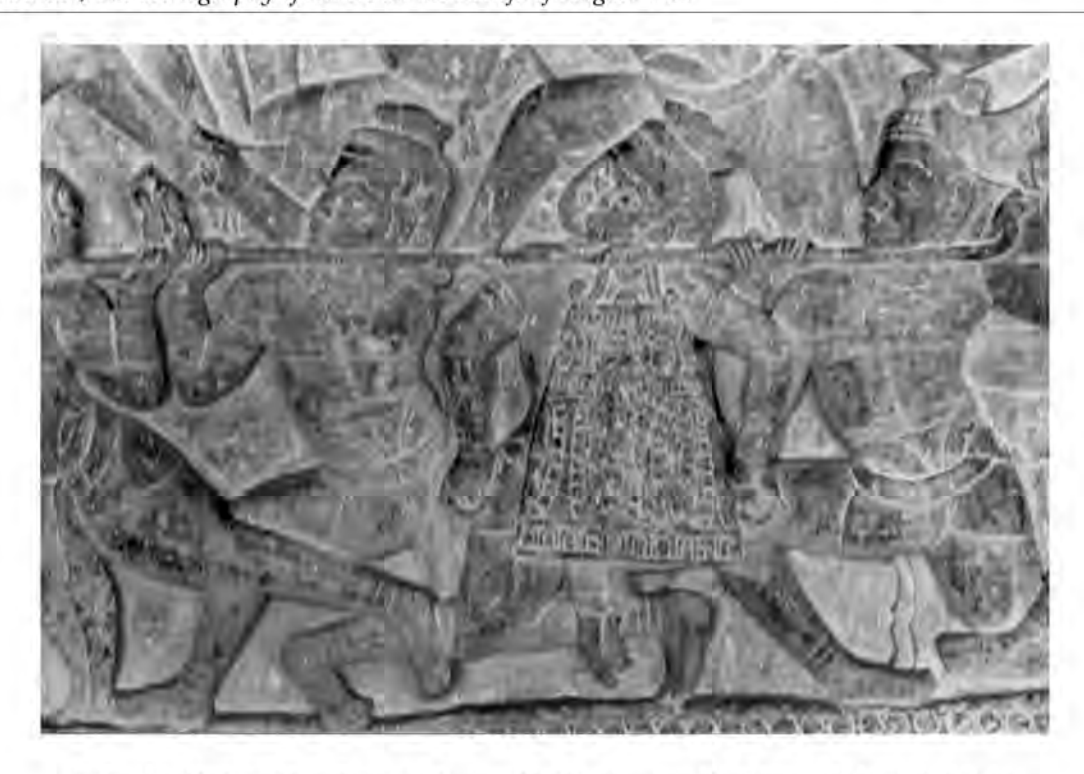
Angkor Wat, north gallery, west wing. The Tarakamaya War. The only large bell to be found among the military ensembles depicted in Angkor Wat.

occasions like the celebration of the birthday of Buddha. I had the opportunity to see and listen to an ensemble there in the spring of 2002, which was comprised of barrel drums and gongs. From a European perspective the sound of such an ensemble is quite martial.