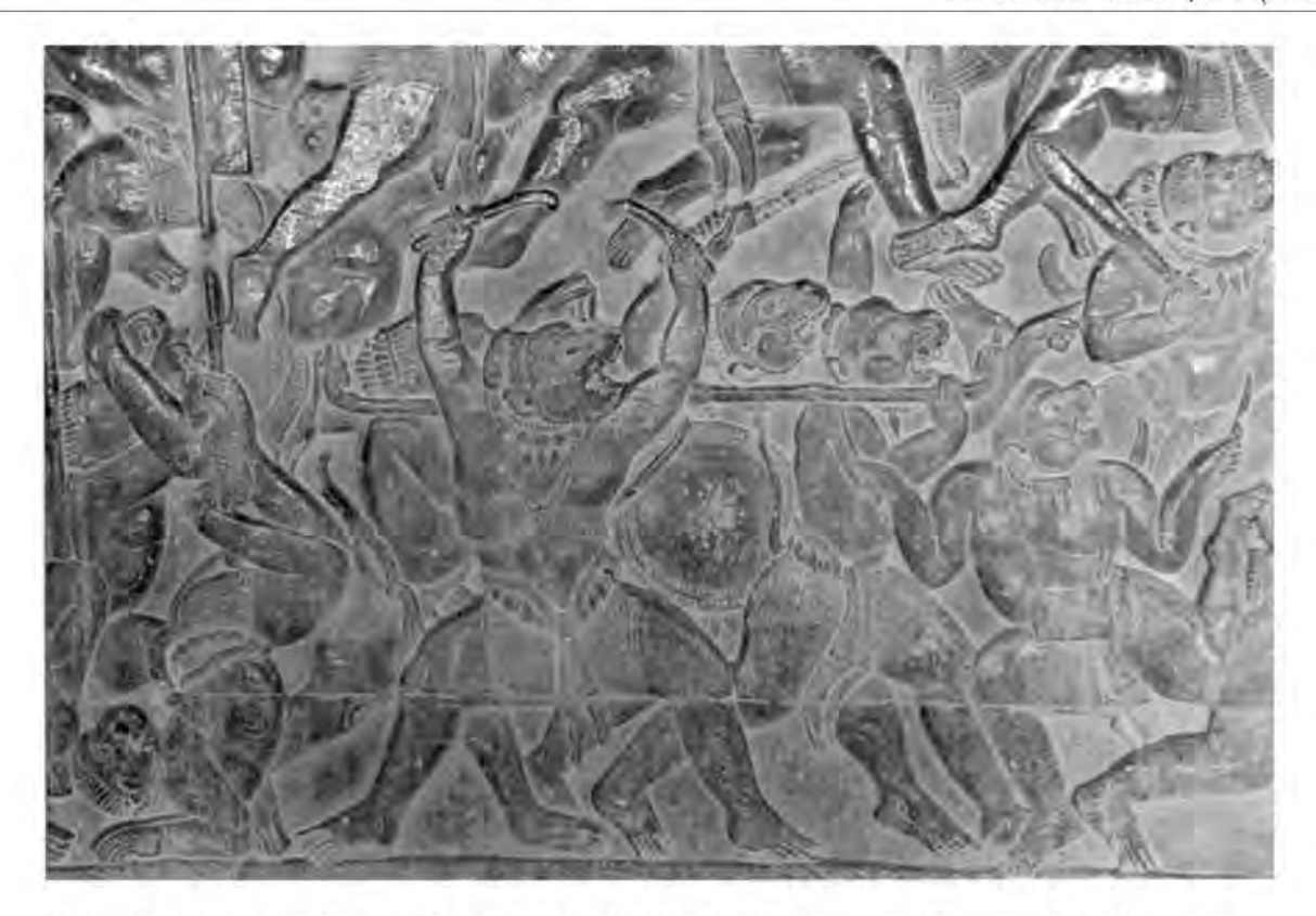
12. Angkor Wat, west gallery, north wing. The battle of Lanka. The warriors of Hanuman's monkey army are playing the same instruments and in the same frenetic manner like the human actors on the other reliefs; compare fig. 4.

regarded to be of divine origin in Southeast Asia.<sup>63</sup> In contrast to this, music — at least that which was performed by the military bands — seems to have been neither a heavenly nor a hellish phenomenon in medieval Angkor.<sup>64</sup> This presumption is confirmed by the fact that on all the reliefs showing battles on both sides, the victorious "good" and the defeated "bad" forces use the same instruments, all of which — as far as the pictures allow us to judge — are played in the same manner. The armies of gods and demons have exactly the same military bands. In this context music is just a part of the fight and is, on its own, as morally neutral as the weapons and strategies used in war. This leads to the question of how people in Cambodia were (and are) listening to music; i.e., it leads us to the field of aesthetics. An aesthetic of the traditional music in Cambodia has not, however, yet been written.