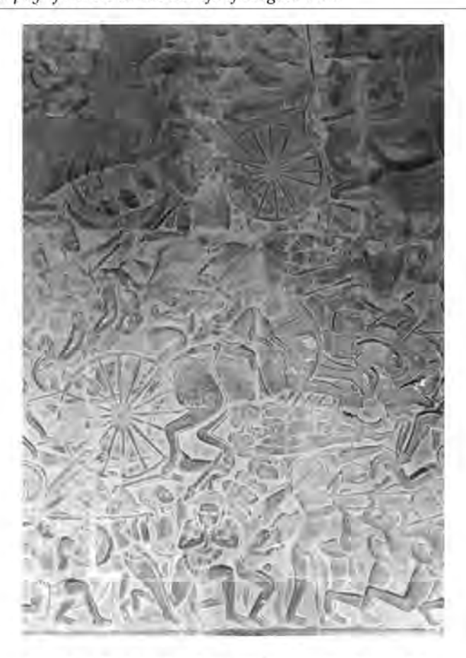
3. Angkor Wat, west gallery, south wing. The battle of Kurukshetra. In the lower part are represented military musicians performing on, among others, a portable gong, carried by two persons and played by the third, and the wind instrument [sralai?] most commonly represented on older bas-reliefs of Angkor Wat.