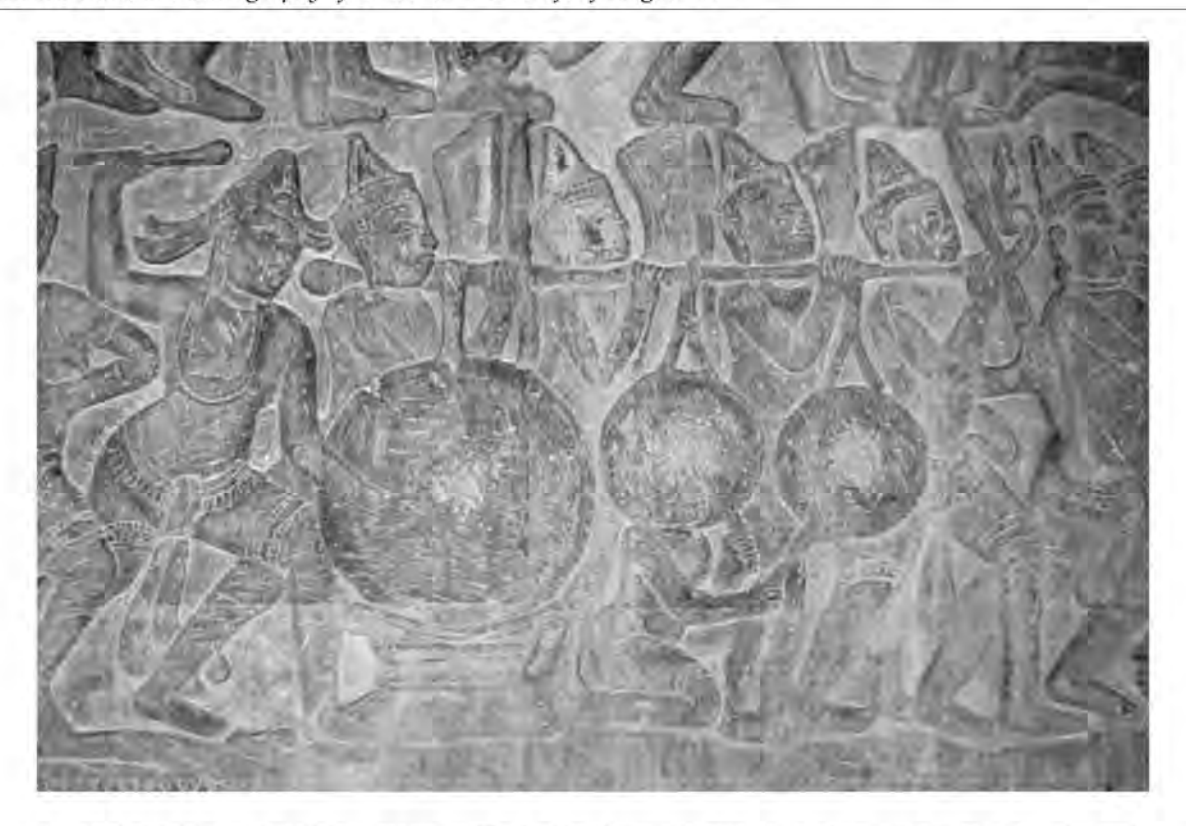
11. Angkor Wat, north gallery, east wing. The battle of Shonitapura. An instrument appearing exclusively on the younger reliefs is this portable set of gongs.

gallery of Angkor Wat shows the battle of Lanka. It is located at a prominent place, since, if in ancient Angkor ritual circumambulations took place on the first gallery, they may have ended here. Hanuman's monkey army is fighting with the demons of Ravana. The monkeys are depicted as ape-headed human beings with athletic bodies, heroically attacking their enemies [fig. 12].