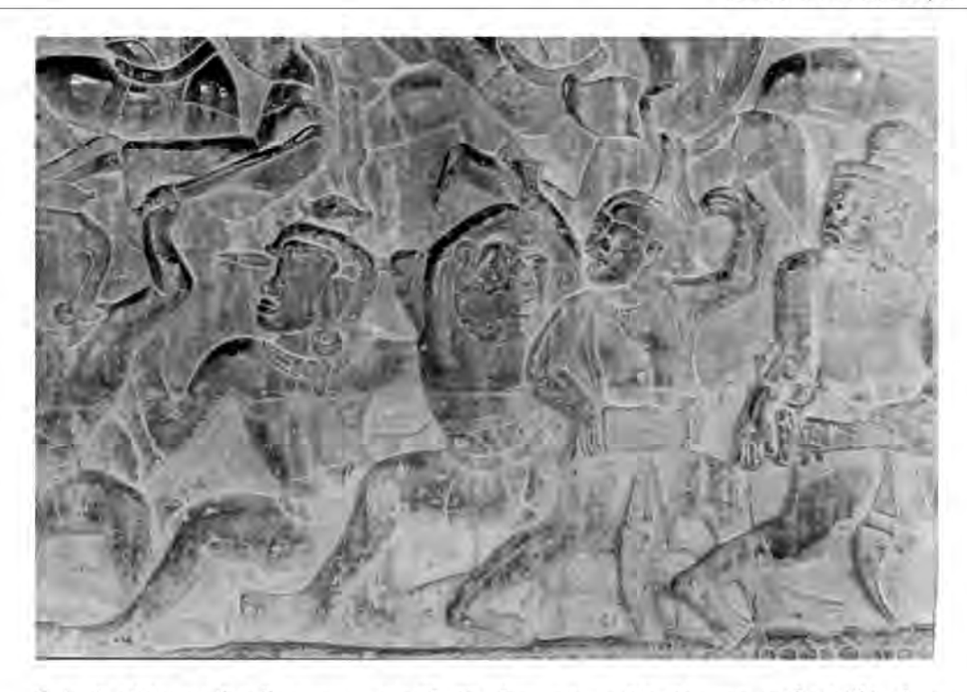
8. Angkor Wat, north gallery, west wing. The Tarakamaya war. Wind instrument [sralai?] is played in a frenetic manner. The drum players on the right show attitudes of dedicated playing.

ensemble to perform traditional Khmer music today; besides that the modern sralai appears as accompaniment of the traditional Khmer boxing fights as well as in the shadow theatre. The ancient instrument on the reliefs is much shorter, and its funnel-like form more closely resembles a bottle or vase than a cylinder. The mouthpiece cannot be seen clearly on all bas-reliefs, but it often appears dissimilar to the oboe-like one which is used with the modern sralai . Furthermore, the ancient instrument always has a flare, while the modern sralai does not necessarily possess one [fig. 8].