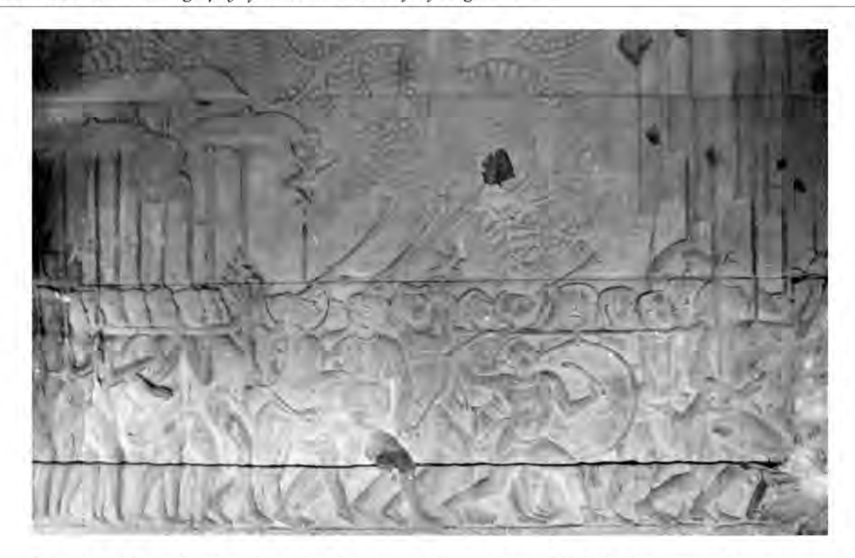
5. Angkor Wat, south gallery, west wing. Procession of king Papramavishnuloka (presumably Suryavarman II). In the procession can be seen several wind instruments in the background. The nature of the curved long instruments in the middle [sâng?] remains unclear. Maybe it was a brass instrument. The straight formed instrument behind the portable gong resembles a nowadays sralai.

compositional principles and iconographic symbolism".<sup>32</sup> The pictorial composition of all the grand reliefs is organized in two ways. The four eastern and western bas-reliefs are symmetrically structured around one central point, while the four northern and southern reliefs are procession-like in form, and are to be read from the left to the right.<sup>33</sup> This means that the grand reliefs as a whole were intended to be viewed via a counter-clockwise circuit. Even though this fact is beyond doubt, "a satisfactory explanation of the logic behind the order in which the Angkor Wat reliefs are presented in the course of this circular movement has not yet been found".<sup>34</sup> The question of whether the galleries could have perhaps served as a place for circular processions, has recently been raised by Hedwige Multzer O'Naghten: