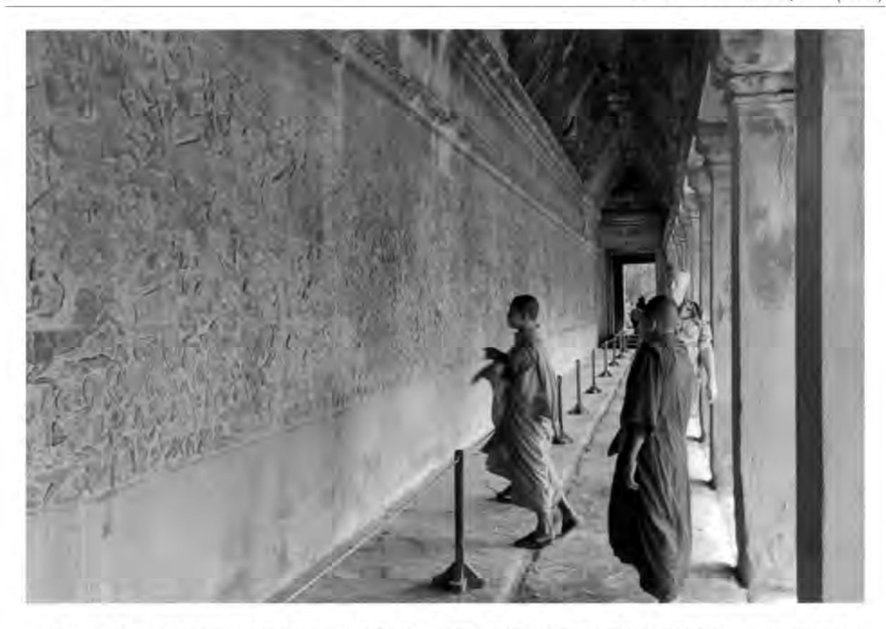
The battle of Kurukshetra in the south wing of the west gallery of Angkor Wat. This picture can give an impression of the dimensions of the large bas-reliefs, especially their overall length.

as November 2007, i.e., 30 years after the incidents — but it is taken for granted that at least a fifth of the entire populations was killed within these four years. One important aim of the Khmer rouge was to extinguish any sort of "intellectuality", a category to which musicians as well as dancers belonged. Only few of them survived this time of horror and started to reconstruct the highly skilled traditional arts of the Khmer dance and music traditions of the ancient days, after 1979. Some of these dancers and musicians tried firstly to create a larger group of competent teachers by educating their own children. These children were then to conserve and hand down the ancient traditions to the next generation. This ongoing process is mainly directed from the Royal University of Fine Arts in Phnom Penh. It is the most important institution for music and dance in the country, as it has been in existence before the war. To become a professional dancer or musician here requires twelve years of education.<sup>10</sup>