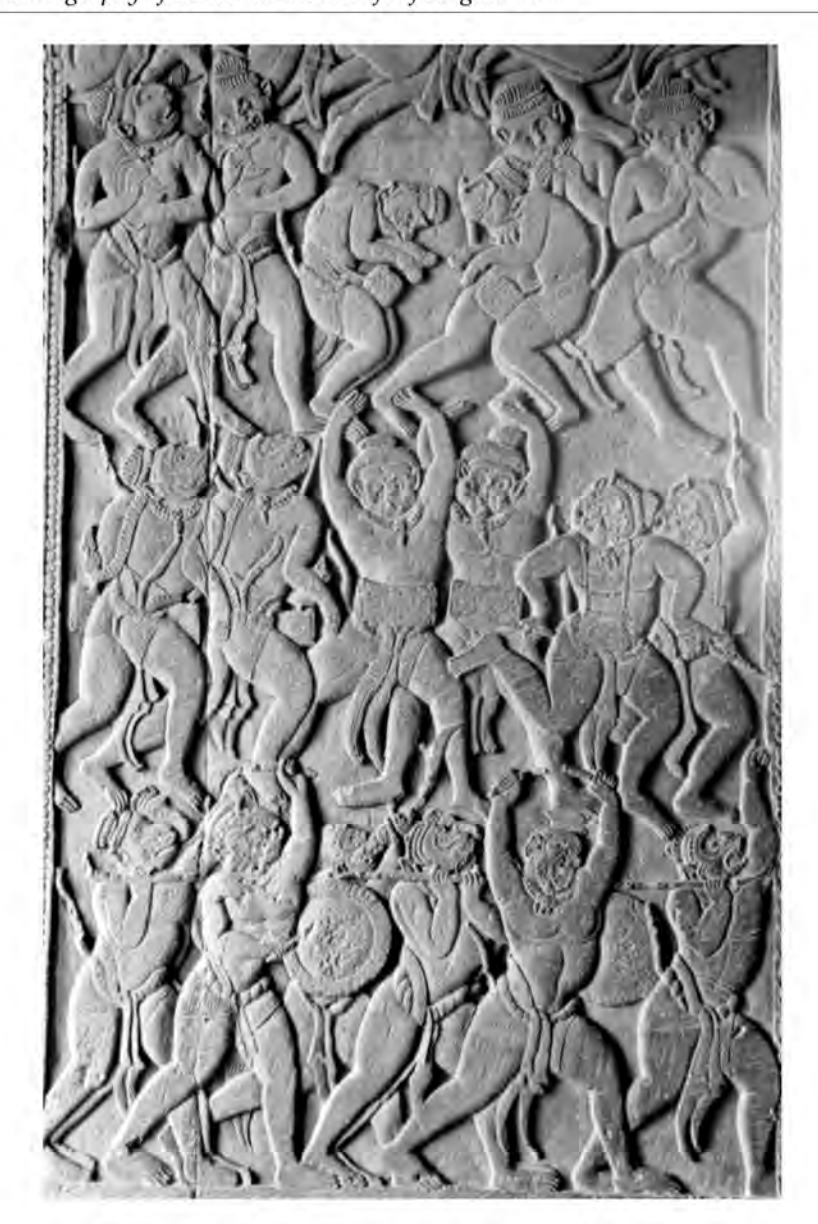
13. Angkor Wat, Pavilion, southwest corner. Scene from the Ramayana . Hanuman's monkeys are shown playing instruments commonly represented on the older reliefs, namely small cymbals [ching], portable horizontal and vertical drums of different sizes, wind instruments [sralais?] and gongs; compare figs. 3, 4, 8 & 9.

An iconographic analysis as I would like to outline it here has to evaluate the engraved sources of Angkor in their entirety. Angkor contains a very large number of such sources — there are still temples and ruins yet to be excavated and reconstructed like the Baphuon temple — which were carved during one coherent historical period, and since there is an almost total lack of written sources, the reliefs of Angkor could serve as an outstanding example of an immanent iconographic analysis of the depiction of music, musicians, and dancers, using results of other disciplines such as archaeology and ethnology. The results of this analysis would then likewise be of importance for these disciplines.