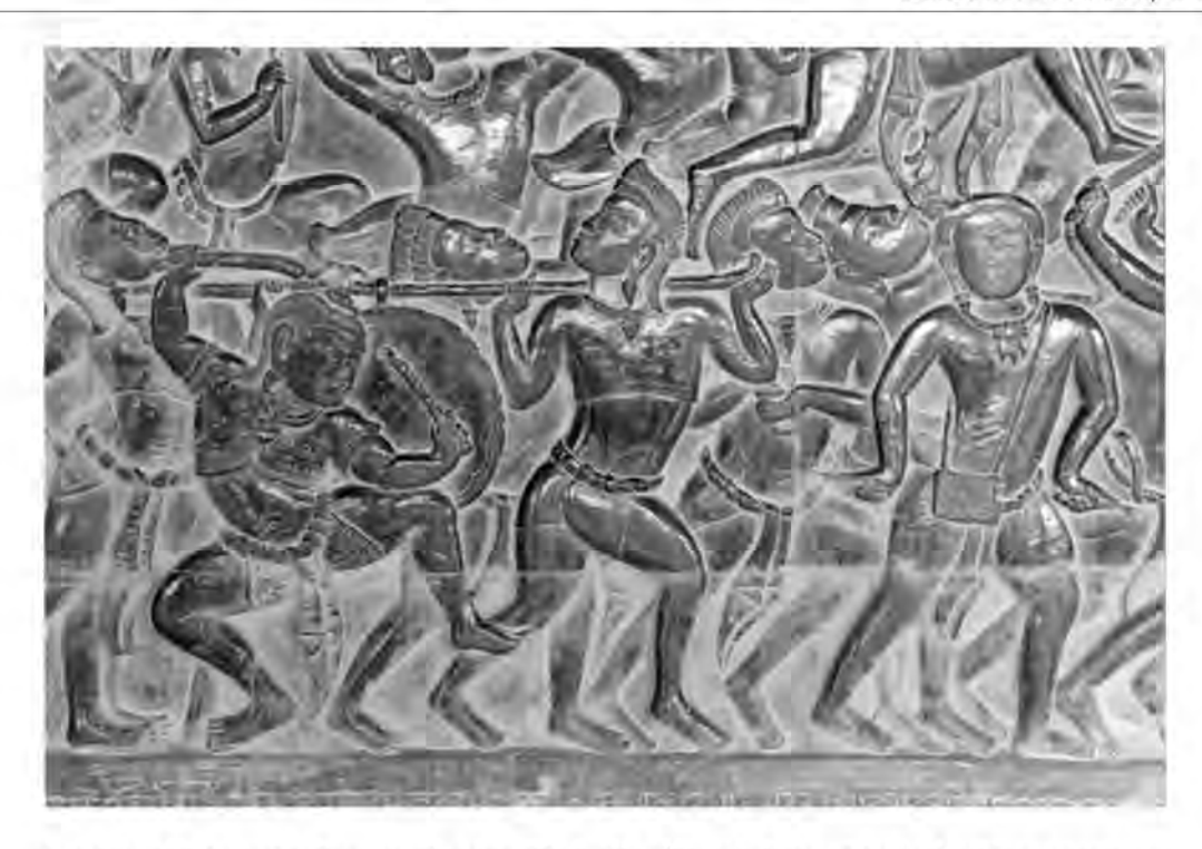
4. Angkor Wat, west gallery, south wing, The battle of Kurukshetra. A typical military ensemble, consisting of from left to right, a portable gong, a pair of small cymbals [ching], a wind instrument [sralai?], and a small horizontal drum. The dancing-like attitude of the gong player is characteristic for many of the musicians depicted in Angkor Wat.

Angkor Wat had been build in the years between ca. 1113 and 1150, which, with regard to the huge dimensions of this building – the biggest religious building of mankind ever built – is a relatively short time. Angkor Wat contains more than 2000 square metres of bas-reliefs. The lion's share of these comprises eight large reliefs on the gallery surrounding the first level of the temple [fig. 1].