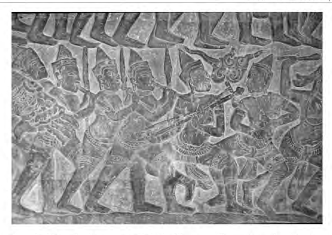
10. Angkor Wat, north gallery, east wing. The battle of Shonitapura. Three musicians play wind instruments which look like a flute. Flutes are not used in nowadays traditional Cambodian music ensembles. Quite astounding is the instrument beside them on the right which seems to be some kind of tror . A tror is by far too low to be used as a military instrument.

horizontal layers — tell us something about their social status? Or what other implications could this have for the interpretation of the carvings?