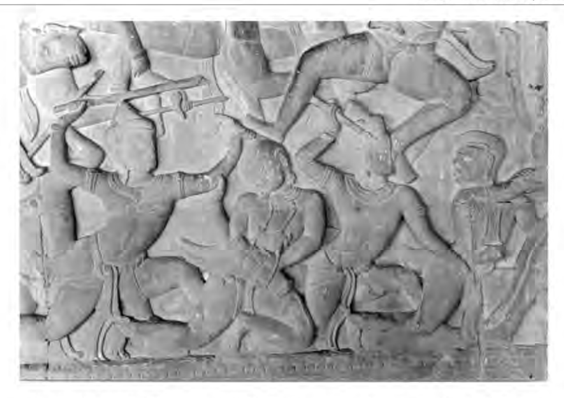
Angkor Wat, north gallery, west wing. The Tarakamaya war. Musicians under attack albeit not armed.

with a bow. Only one of them, the tror Khmer , has three strings tuned in perfect fourths. The seven other types have two strings, tuned a perfect fifth apart, and are played with the bow placed between both strings. <sup>39</sup> Thus both sides of the hair of the bow are used by pressing it—sometimes alternatively—on one of the strings. The range of the two-stringed trors is one octave when played in the first position. The tror is widely thought of as being of Chinese origin and to have been used as a Southeast Asian musical instrument relatively late. Beside the tror , many instruments and instrumental ensembles—not to mention the classical Apsara dance <sup>40</sup>—are very similar to contemporary instruments, ensembles, and performance practices. To quote Sam Ang-Sam: "Consequently, we have every reason to believe that the present Khmer musically [sic!] forms are the living continuation of the musically [sic!] tradition of the ancient Khmer".<sup>41</sup>